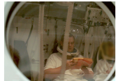
« Under Pressure » by Johan Ask Pape